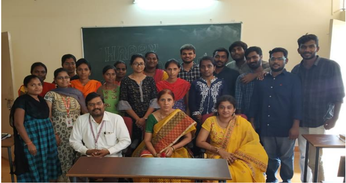
Faculty with the students