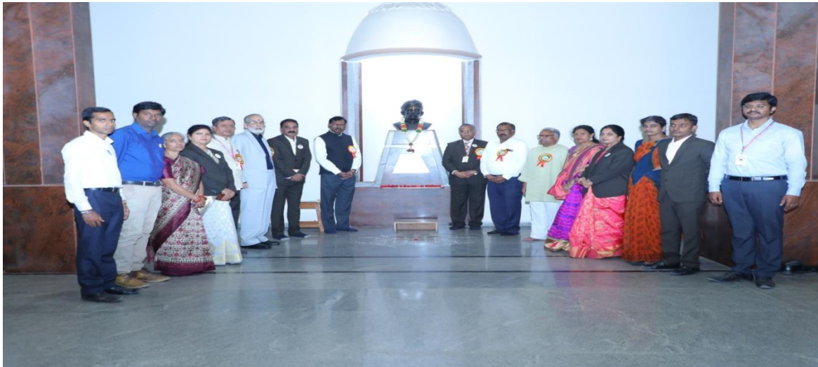
Guests along with the management and the faculty at the keshav rao koratker statue