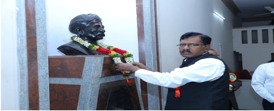
Guest garlanding the keshav rao koratker statue