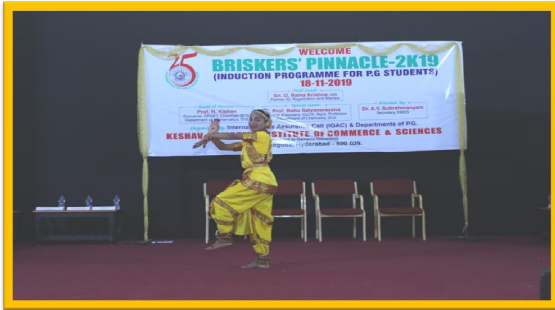
Welcome dance by the student