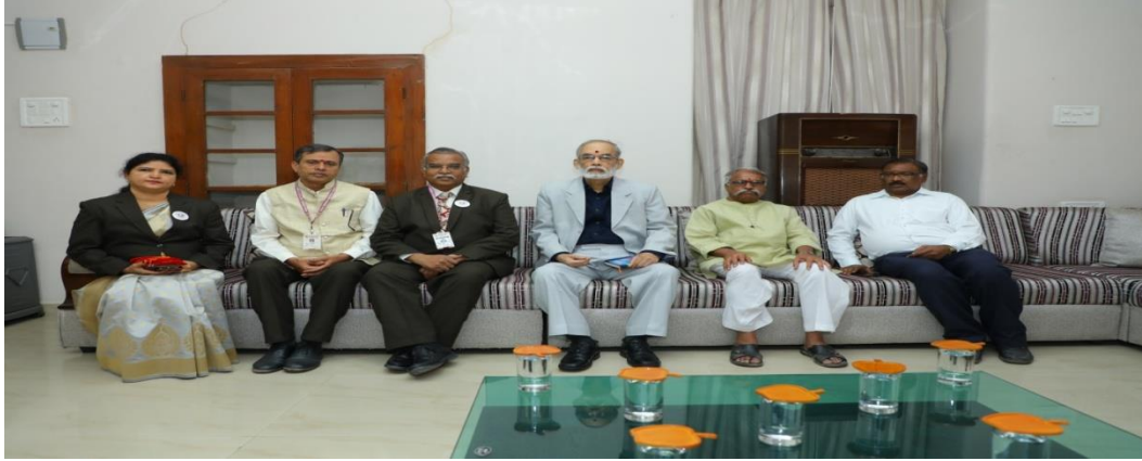
Guests with the management