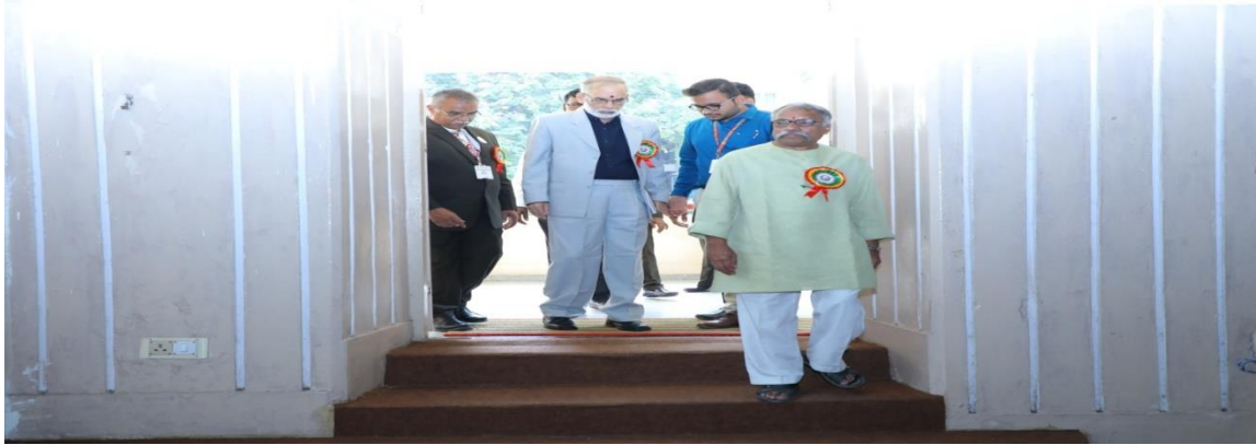
Guests arriving in to sardar patel hall